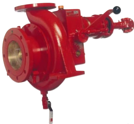
The D-240 boat pump is equipped with manually operated mechanical clutch.